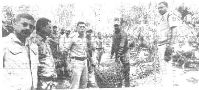
Forest personnel arrive to capture the tiger on Monday

The Chief Wildlife Warden of Goa has already issued a show-cause notice to Karnataka government against carrying out work in the Mahadayi river basin.